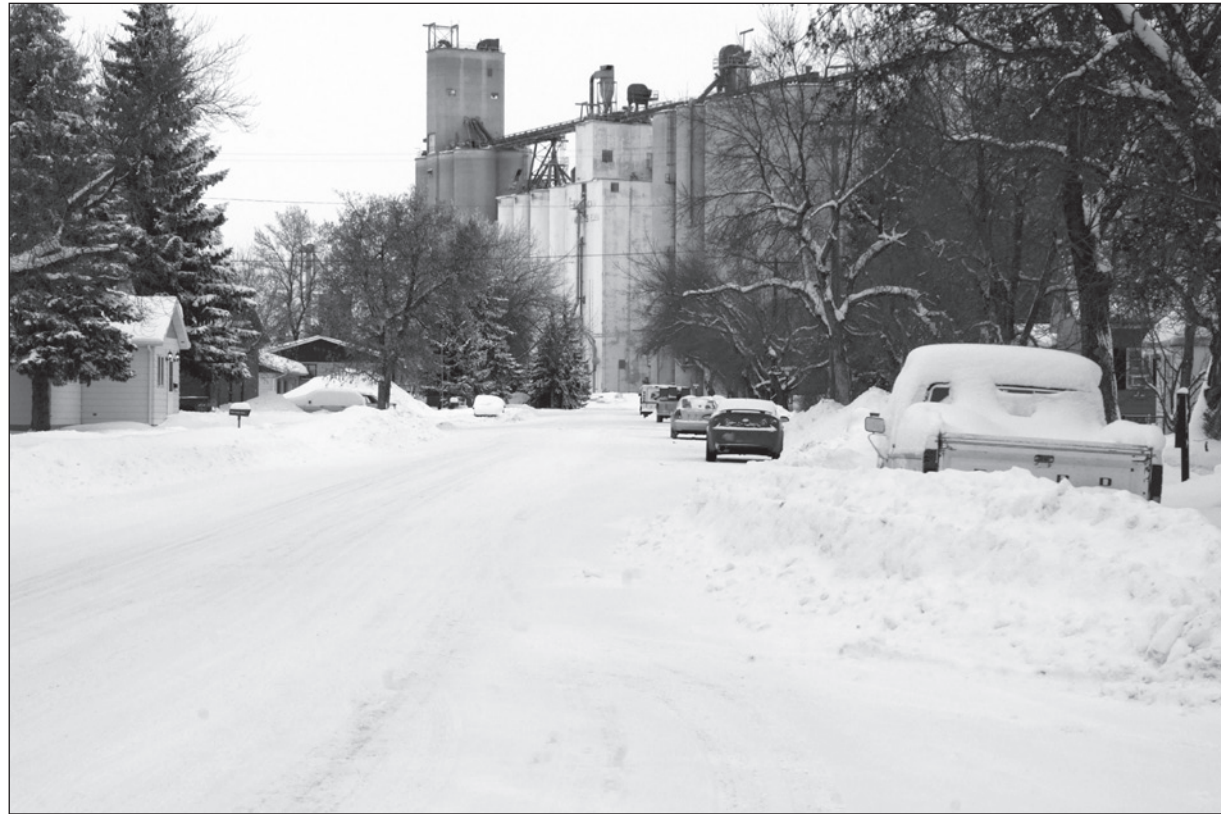
While the city deals with narrow streets, such as the one pictured above, it is also has to work with vehicles that are not being moved off the street after a snowfall. Because local residents are not moving their vehicles, the city's grader has to go around the vehicles, making a bigger ridge, while at the same time making the street more narrow.