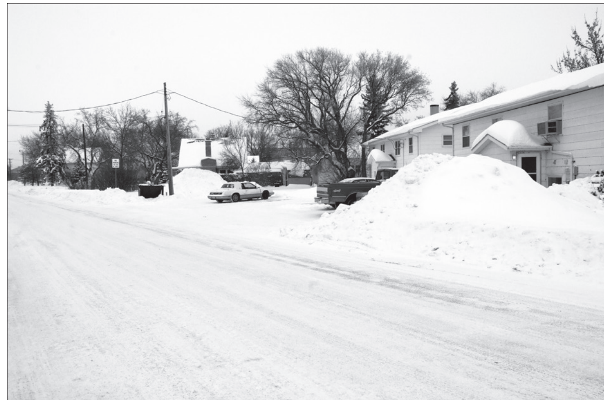
With snow being plowed up into large banks, drivers on this Bottineau street find it difficult to spot cars backing out of this apartment complex and residents of the complex cannot safely back out into the street. The city asks individuals who are creating the snow banks to haul them away from their properties and buildings to make for safer driving.