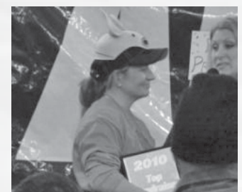
2010 Top Fundraiser