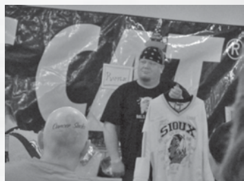
Survivor recipients at the 2010 Event.